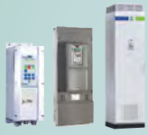
FDU / VFX