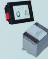
HMI & PLC